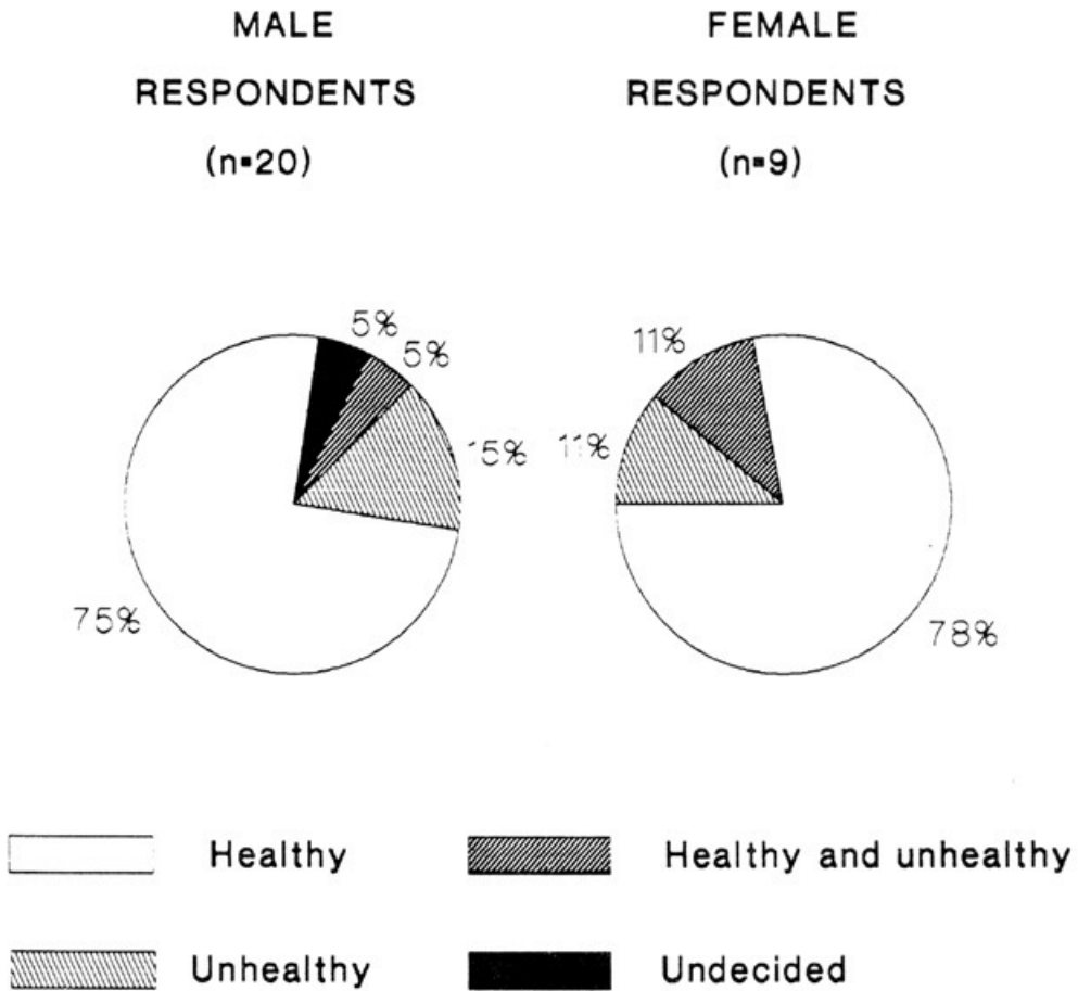
Figure 2: Self assessment of health by homeless people.

The findings of this study do not concur with previous reports that 30 to 39% of homeless adults perceived their health status as being poor (Bowdler & Barrell, 1987; Fischer et al. , 1986; Robertson & Cousineau, 1986). In the current study several of the respondents with chronic illnesses and/or disabilities perceived themselves as healthy, indicating that their definition of health entailed more than the absence of disease. For them, the perceived assessment of health was a reflection of the individual's conception of health.